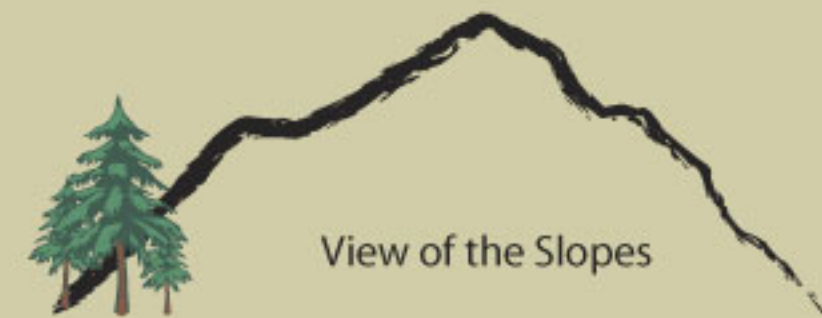
View of the Slopes